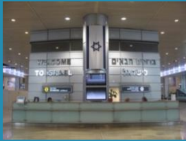
Ben Gurion Airport, Tel Aviv