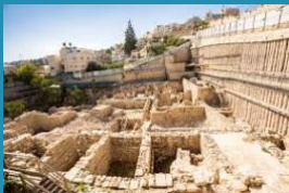
City of David