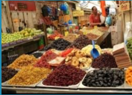
Machane Yehuda Market