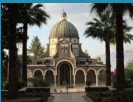
Mount of Beatitudes